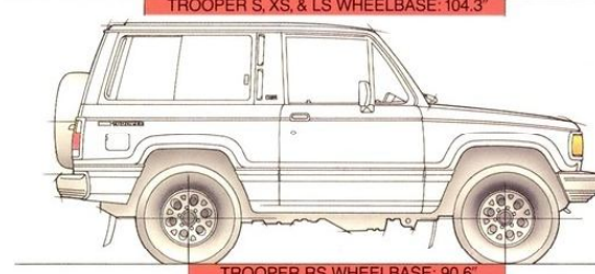
For '89, choose the standard 4-door Trooper or the sporty new, short wheelbase 2-door RS.